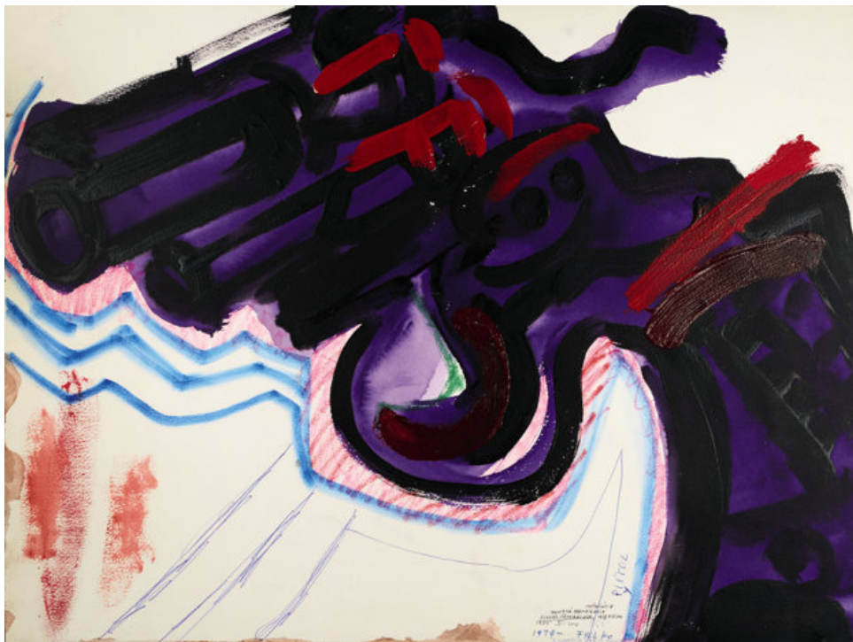
STANISLAV FILKO: Slovak Scheherazade IX, Pistol III (1978), acrylic and ink on paper, 56 by 76.5cm

Of the three successful Slovak artists, Dobeš has developed the programme of "dynamic constructivism" and optic and visual-kinetic art; while Filko is a prominent personality of central-European avant-garde, and Želibská connects pop-art with post-conceptual tendencies. Recently, her works have been included in the exhibition The World Goes Pop in Tate Modern and in the International Pop in the Walker Art Center.